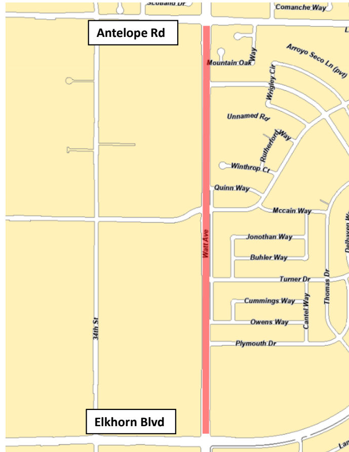
Watt Avenue Elkhorn Boulevard to Antelope Road