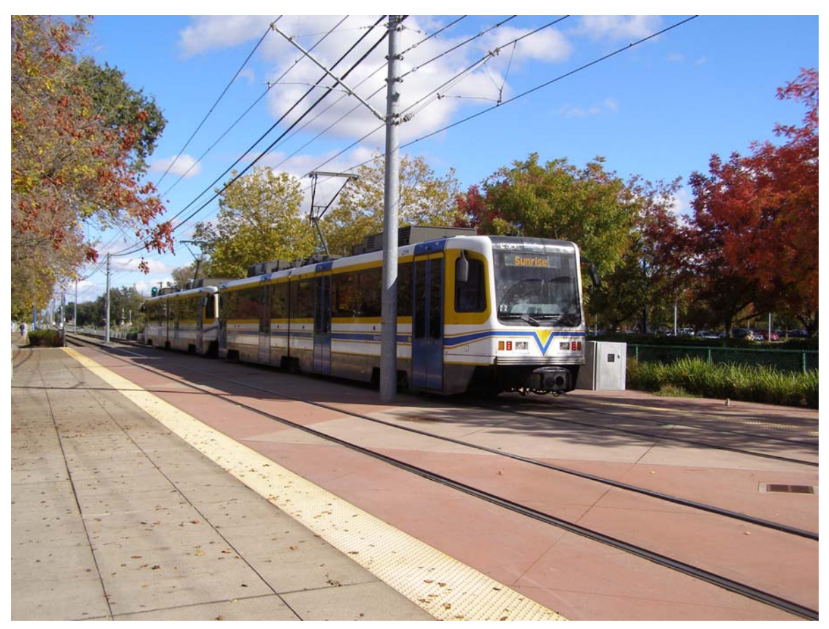
Light Rail/RT Corridor