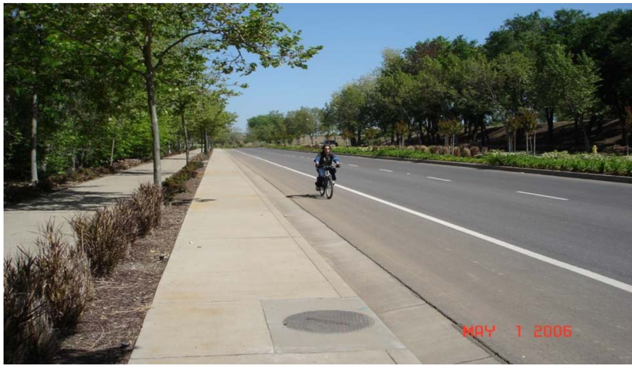
Improve Bike Lane Connectivity