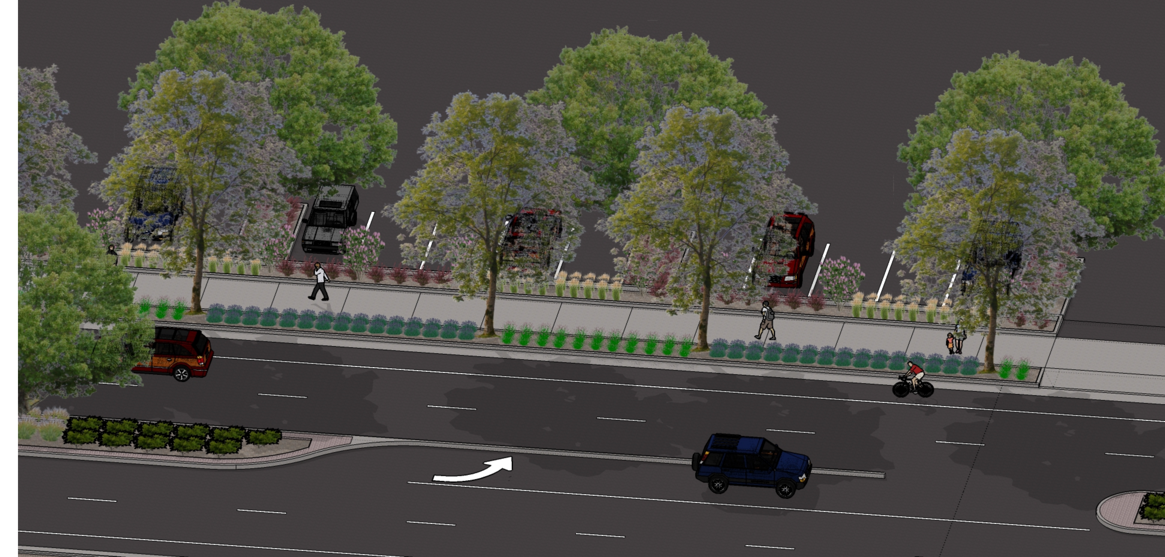
Example of proposed roadway design.