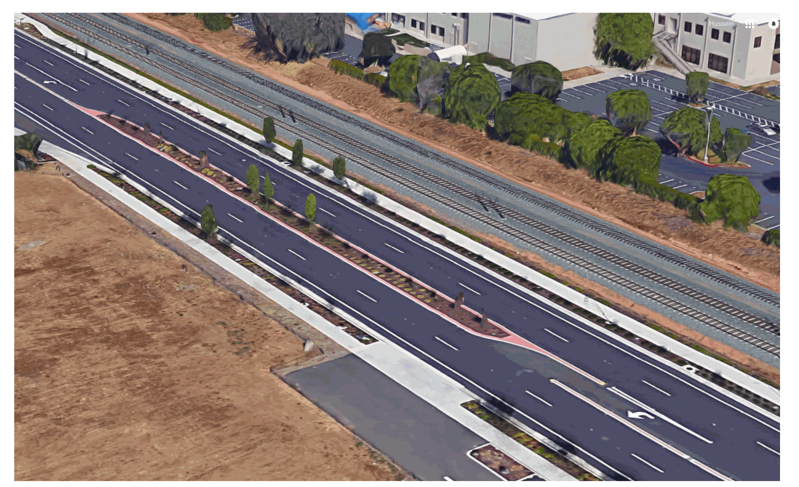
Existing roadway within City of Rancho Cordova